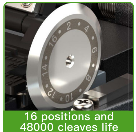
16 positions and 48000 cleaves life