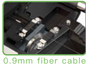
0.9mm fiber cable